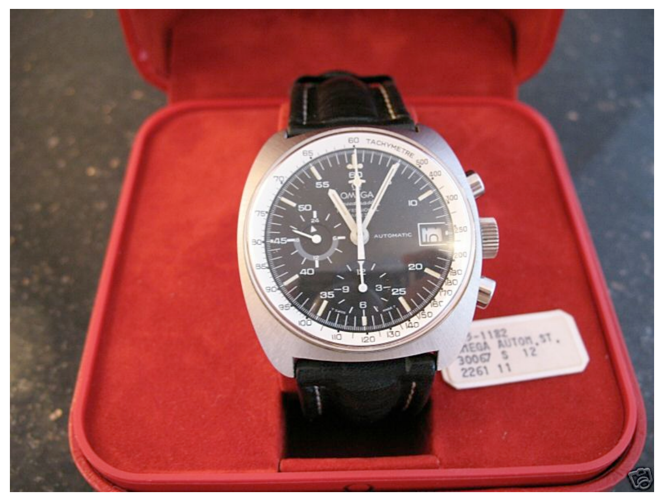
I don't have a copy of SAGA in front of me, but I'm really still undecided about these watches and whther they are just redialed Seamasters (a small theory here... A Seamaster is designed to get wet, many some of them have got water damaged & the Speedy MK III dial was the cheapest/easiest dial to get/fit?)

I really don't know [or believe] that the Seamasters of this era were really all that more water resistant than the Speedmasters of that era.