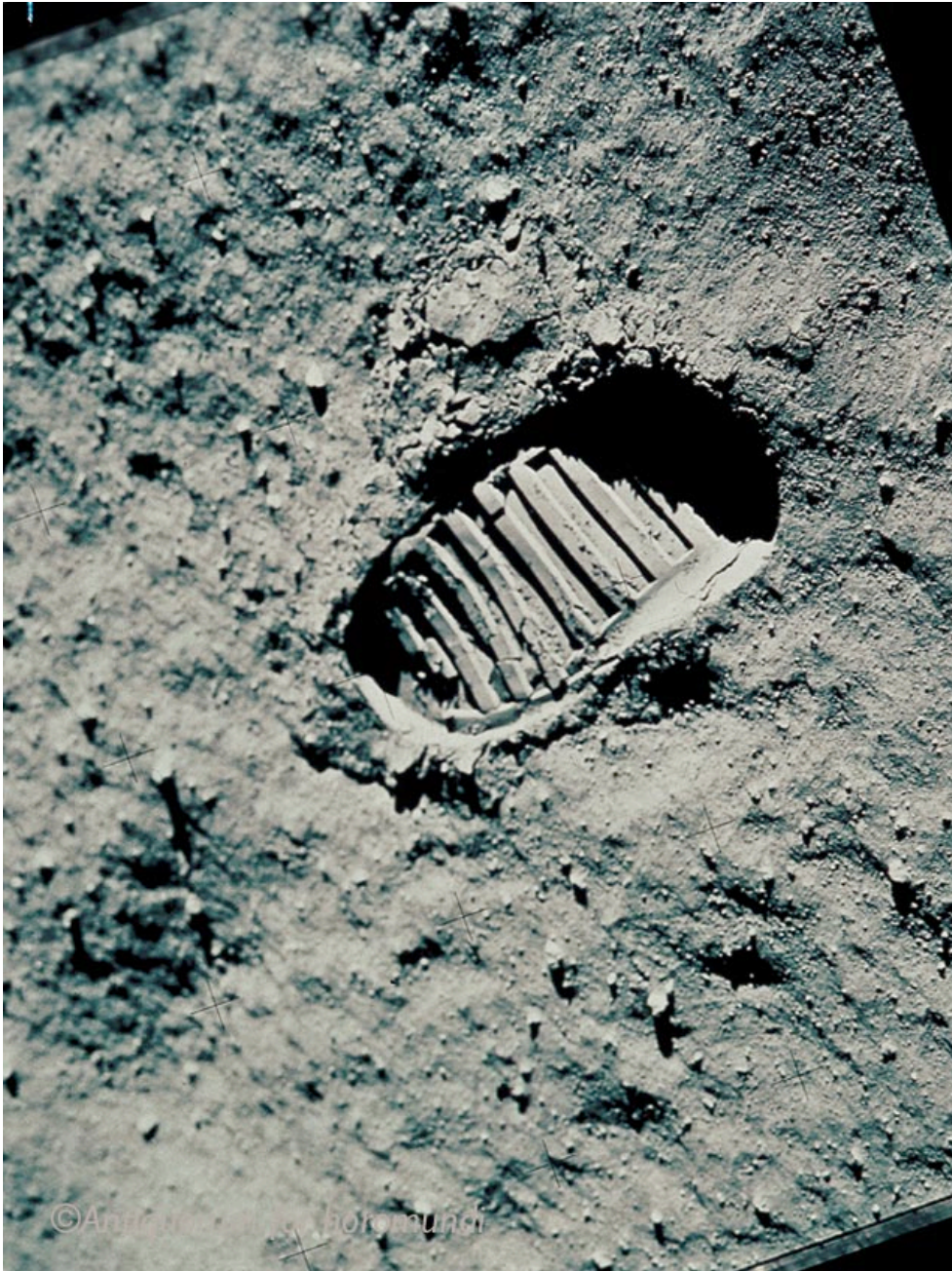
1969, On July 21st, the Omega Speedmaster Professional chronograph becomes the first watch ever worn on the Moon, as the world marvels at man's first steps on the Earth's natural satellite.