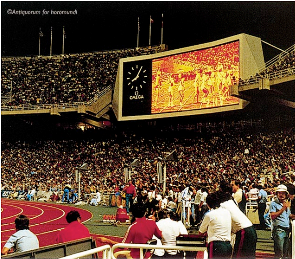
1985, Creation of the first giant color matrix scoreboard.