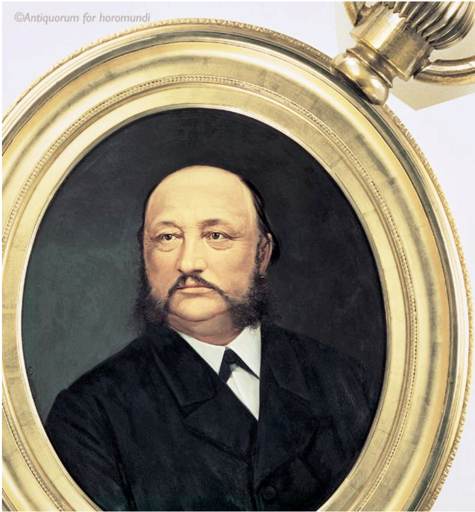
1848, Louis Brandt creates a pocket watch assembly workshop in La Chaux-de-Fonds, Switzerland.